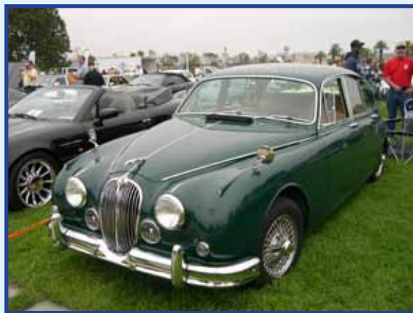
Tim and Sandi Woodard's beautiful MK 2