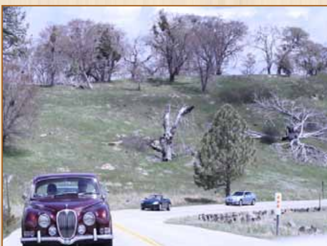
Craig and Sue in their new 3.8S followed by the Rummell's XK and the Hodge's XF

After an interesting departure from the parking lot, the drive went smoothly to our first stop at Lake Cuyamaca where we stretched our legs and socialized.